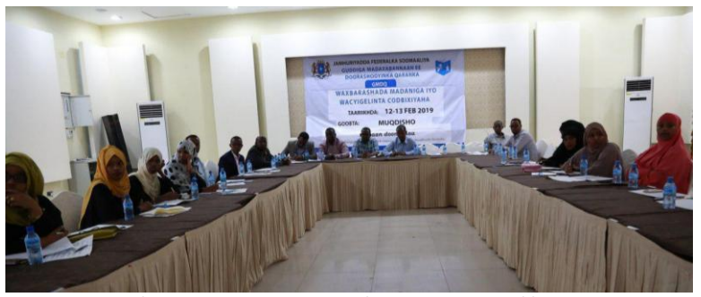
Youth in a seminar on Voter Education organized by NIEC. Mogadishu, 12-13 February 2019.

From 12-13 February, the NIEC conducted a two day seminar in Mogadishu on voter and civic education to sensitize youth for the 2020 electoral process. More than 100 participants from local youth organizations, political parties, NIEC Outreach Departmental staff, 3 NIEC Commissioners and an official from the Political Party Registration Office also attended the seminar.