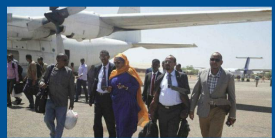
NIEC Chairperson present in Baidoa for several engagements in South West State 19 January 2018, (Photo credit: NIEC)

A team from the NIEC visited Baidoa on 19 January. The team which consisted of NIEC Commissioners and its secretariat staff conducted several activities in South West State. The team oversaw the opening of the NIEC state office, conducted a sensitization workshop on the electoral process as well as the recruitment of the staff for the new office. They also conduced the by-election for a vacant seat in the House of the People.